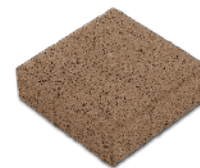
8 x 8 Square