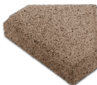
Bishops Hat 9.36" x 11.14" 60mm