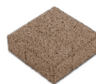
8 x 8 Square 7.87" x 7.87" 60mm