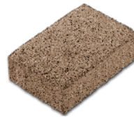
Antique Cobble I