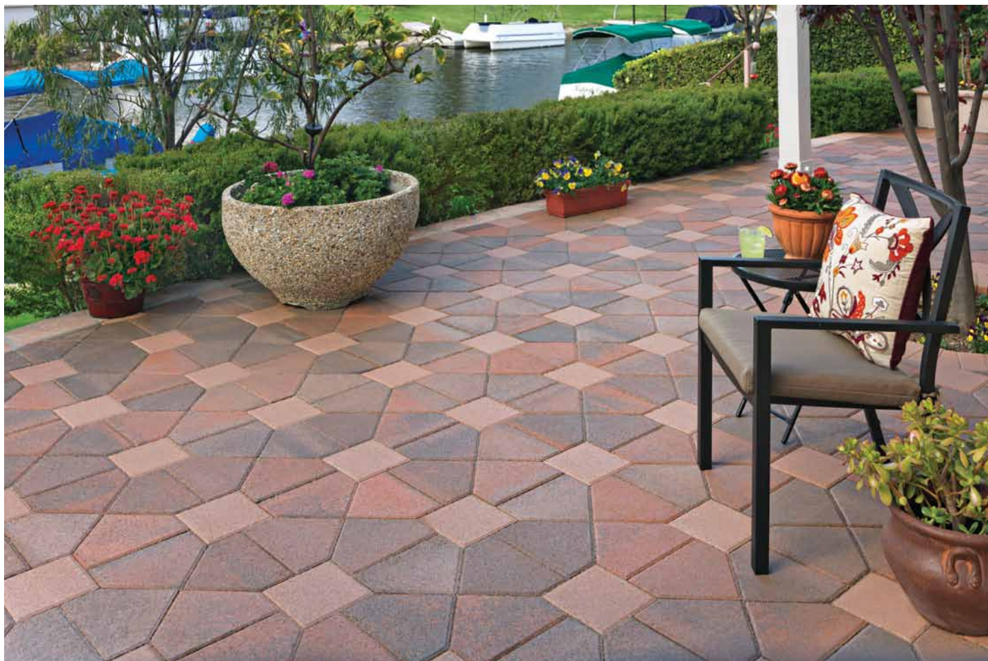
Shown: Cream-TerraCotta-Brown Bishops Hat and solid Cream 8 x 8 installed in a Venetian parquet pattern.