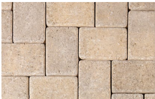
SAND – STONE (TUMBLER)