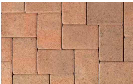
CREAM – TERRACOTTA – BROWN