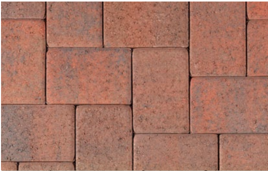
RED – BROWN – CHARCOAL

Shown: Antique Cobble I & II; 50/50 blend of TerraCotta-Brown (special order color), and Red-Brown-Charcoal installed in an "I" pattern.