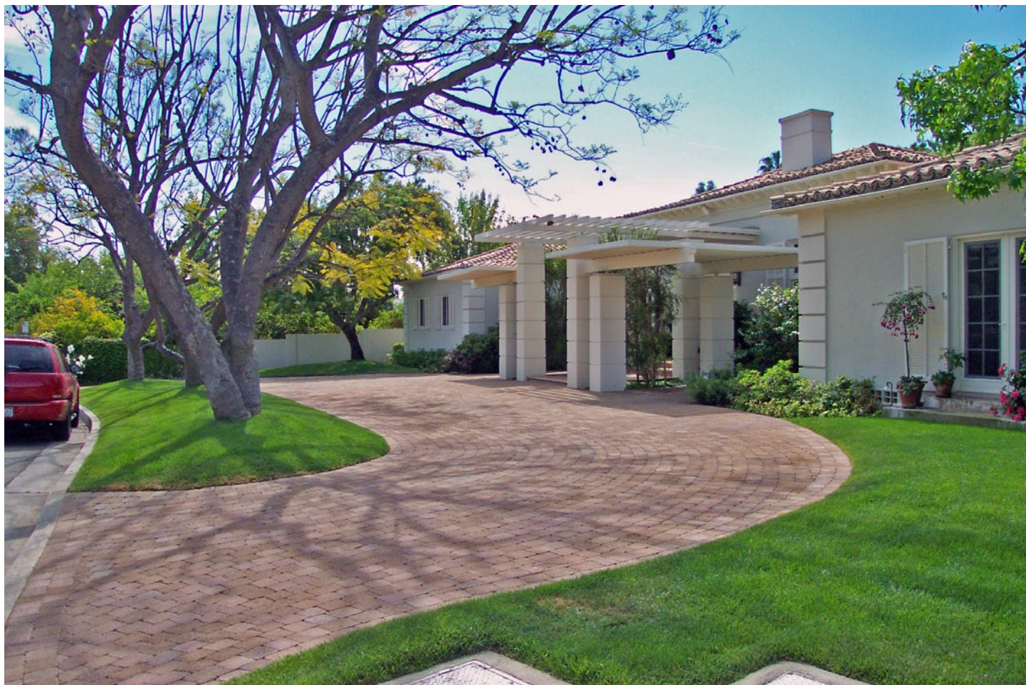
Shown: Sand-Stone Tumbled Quarry Cobble installed in a running bond pattern.

Visit AngelusPavingstones.com for stocked colors information