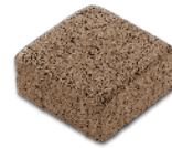
Antique Cobble II