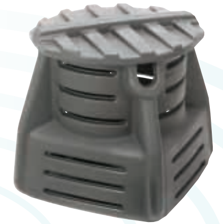
Pro Mini Pump Vault